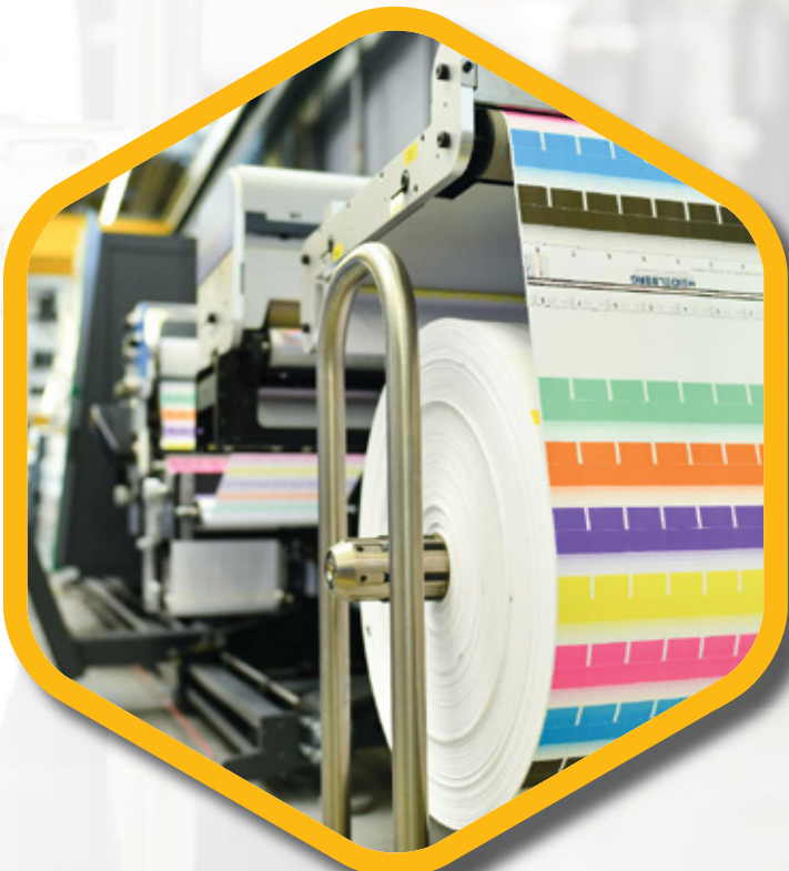
Label Print Machine