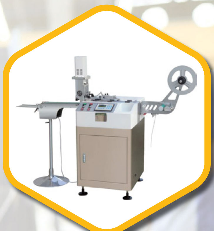
Label Cutting Machine