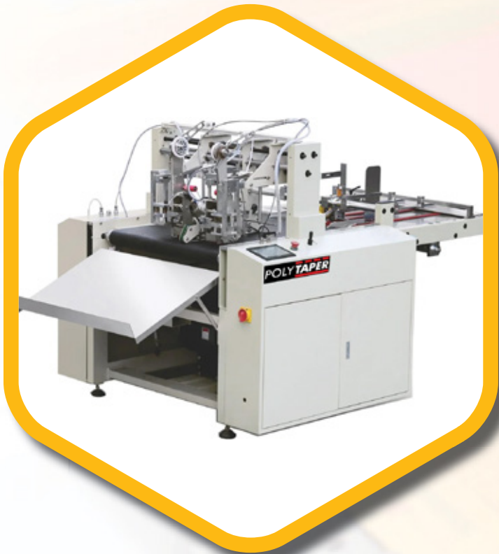
Heat cutting & Folding Machine