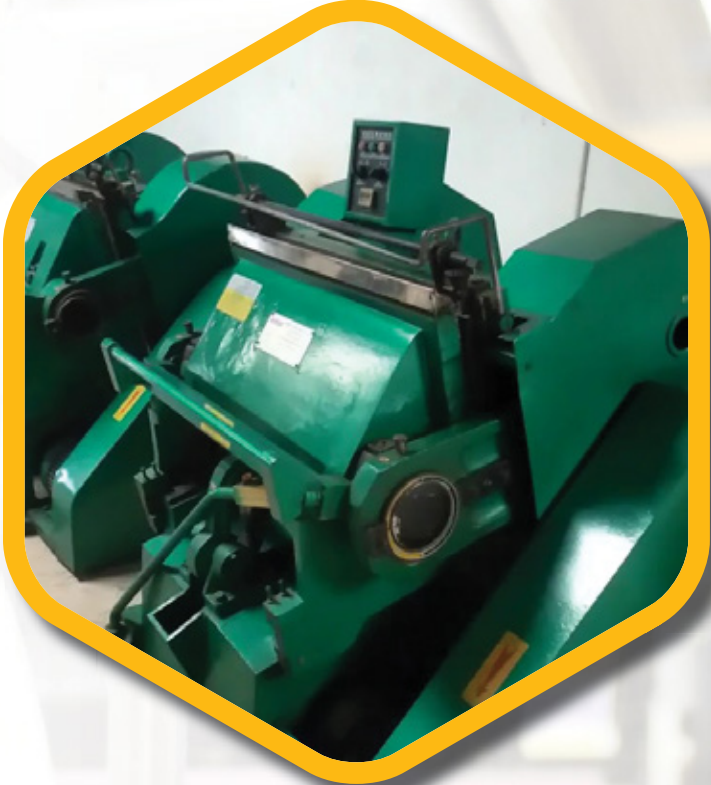
Die Cutting Machine