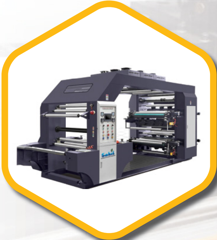
Flexo Label Machine